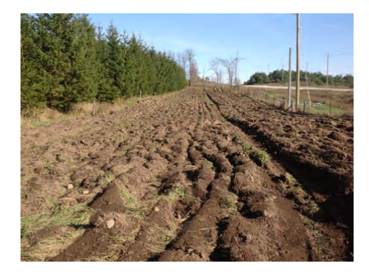
Plate 5: Overview of study area 3, EDU 1039; view west