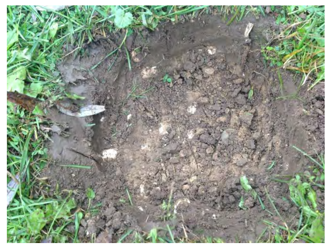
Plate 7 : Study area 4, EDU 1030, example of a distrubed test unit from the manicured western lawn at the southern edge of the study area; view south