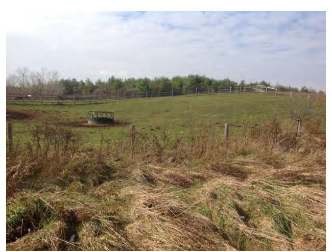
Plate 11 : Study area 4, EDU 1030, showing the slope and animal paddock areas to the north of the farm house; view northwest