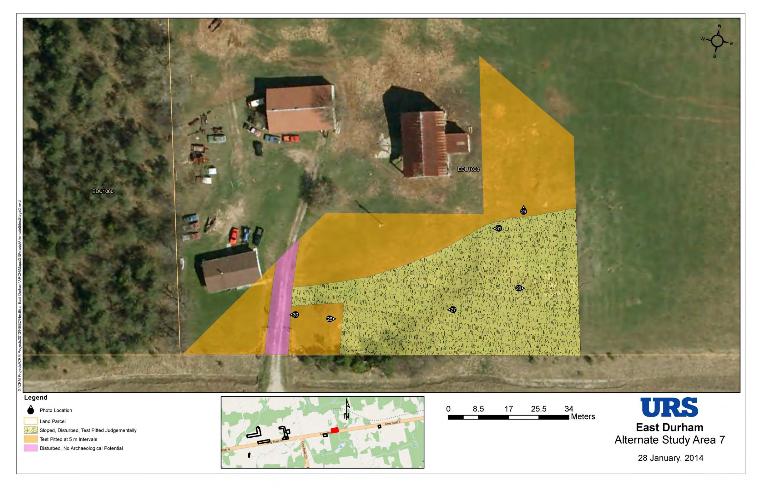
FIGURE 10: RESULTS AND SURVEY METHODS OF THE STAGE 2 ASSESSMENT OF STUDY AREA 7