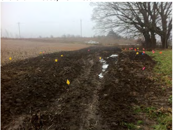
Plate 12 : Study area 4, EDU 1030, showing the eastern portion of Location 5, subject to pedestrian survey; view southeast