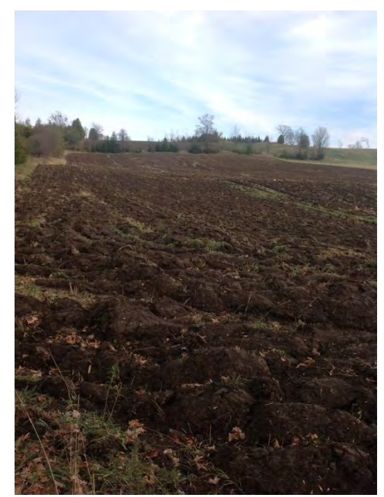
Plate 2 : Overview of study area 2, EDU 1039, ploughed agricultural ; view north