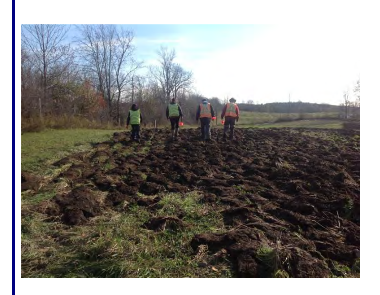
Plate 1 : Overview of study area 1, EDU 1062, with crew at work conducting pedestrian survey; view south