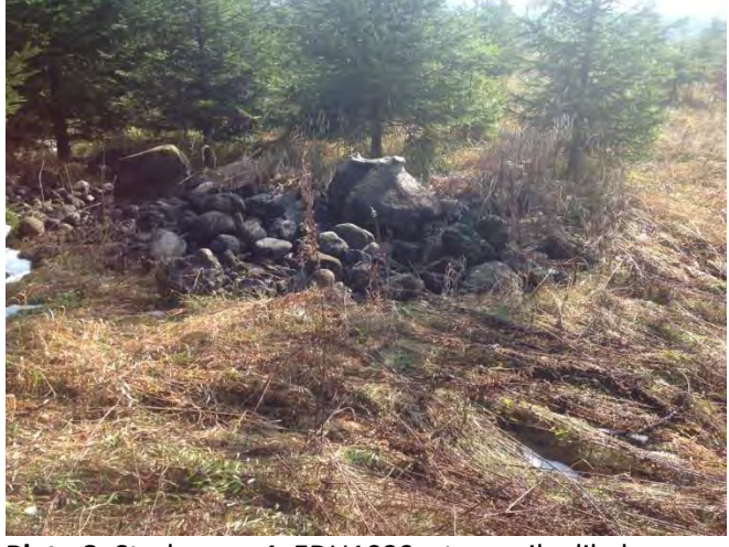
Plate 8 : Study area 4, EDU1039, stone pile, likely associated with the gravel quarry to the east, located in the north east section of the property; view north