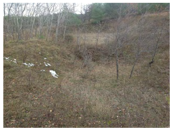
Plate 10 : Study area 4, EDU 1030, showing disturbance from quarrying activities in the scrub to the northwest of the farm house; view west