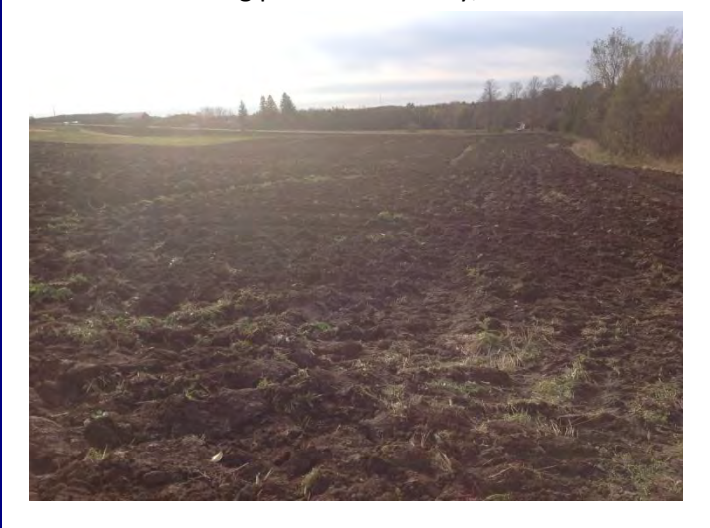
Plate 3 : Overview of study area 2, EDU 1039, ploughed agricultural field; view south