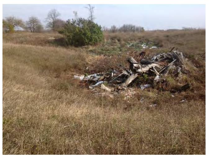
Plate 9 : Study area 4, EDU 1030, showing refuse dump to the north of the study area; view east