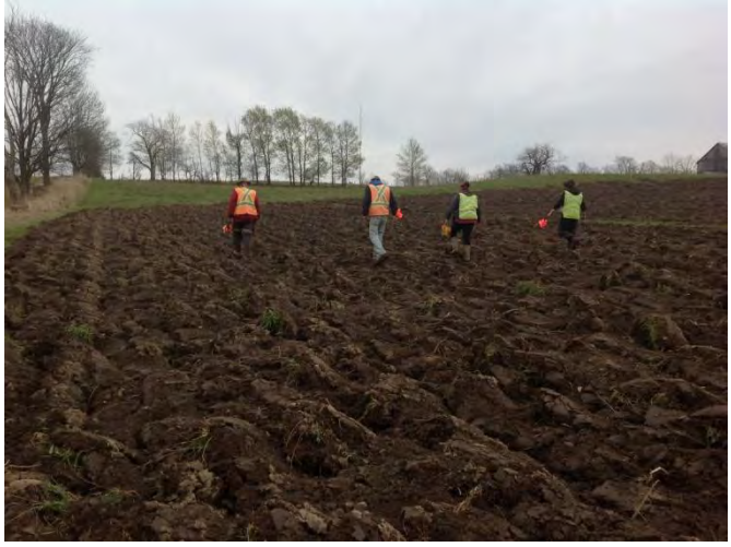
Plate 4 : Overview of study area 2, EDU 1039, with crew at work conducting pedestrian survey at 5 metre intervals; view south