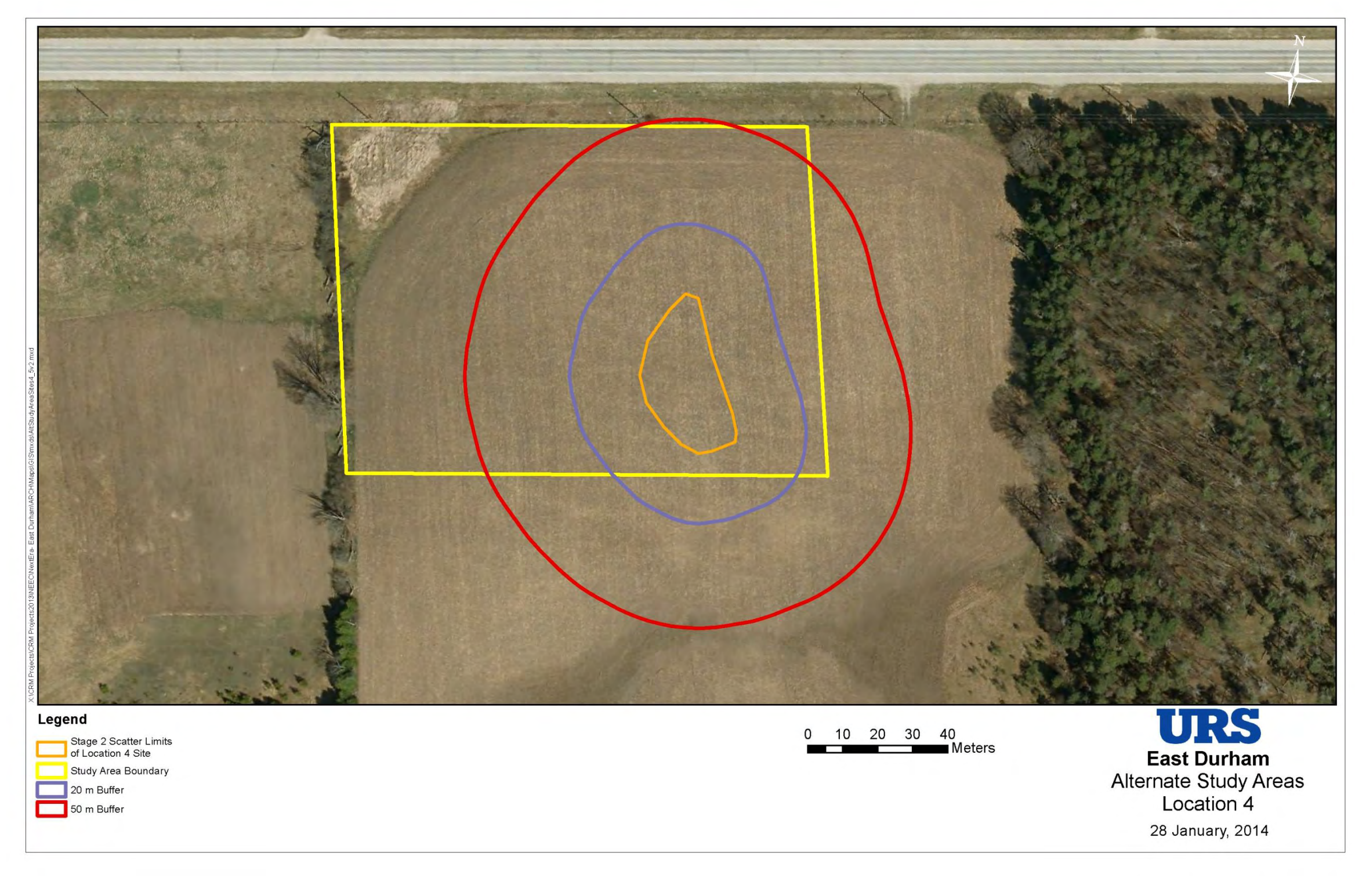
FIGURE 12: THE LOCATION OF THE LOCATION 4 SITE (BBHE-3) IN THE EAST DURHAM ALTERNATE STUDY AREA