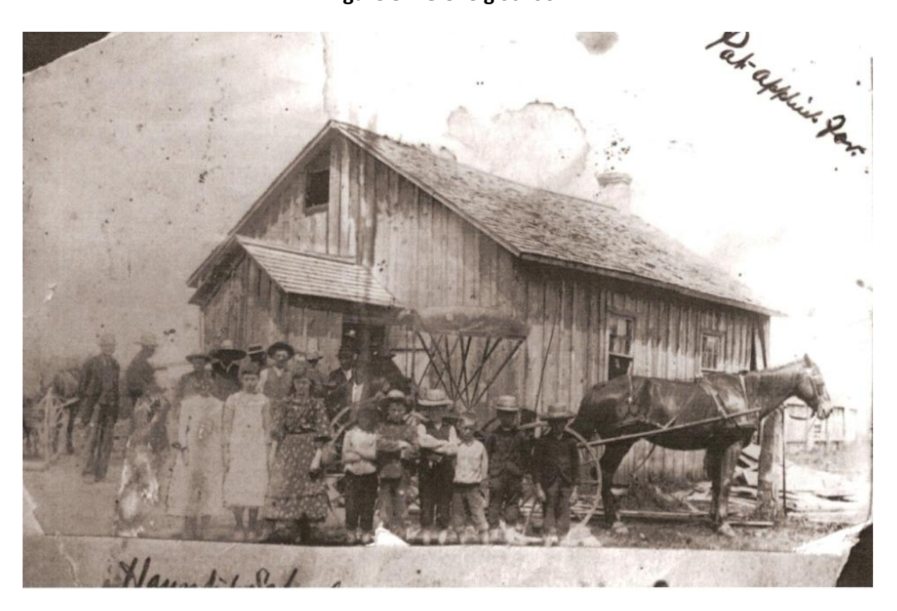
Figure 8 – Glenelg School

BUNESSAN SCHOOL, S.S. No. 1 Glenelg.