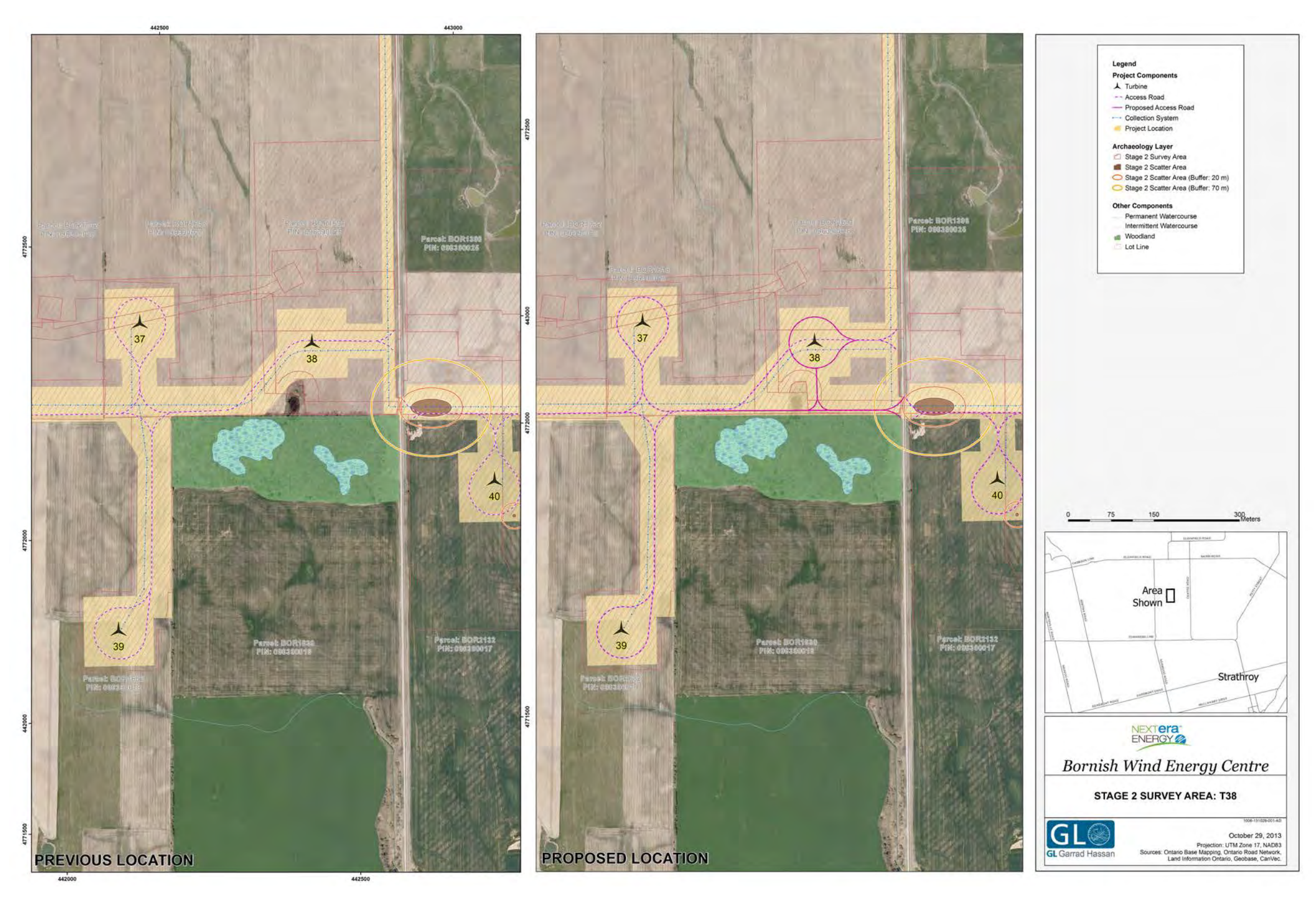
Figure 2-1: Proposed Layout Modification