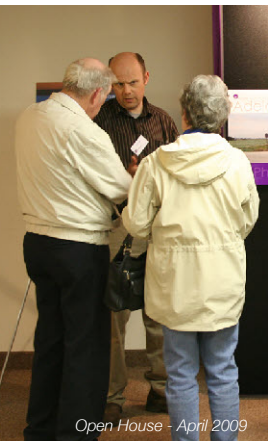
Open House - April 2009

Welcome to our community newsletter in which we hope to bring you up to date on the progress of our wind farm project in Adelaide-Metcalf and to answer some of the questions raised since our open house events in February 2008 and April 2009.