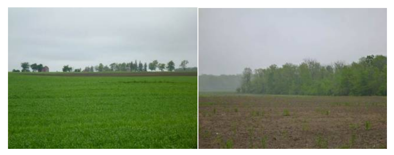
Figure 2-1: Land features of the Parkhill Interconnect Site

The landscape in the study area is predominantly characterized by agricultural fields and associated farms punctuated with numerous hedgerows, isolated woodlands, and the occasional watercourse. Photographs included in Figure 2-1 show typical views of the land and features of the study area.