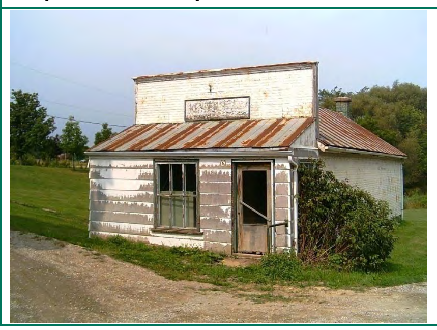
Site # 20 House located at 28520 Sullivan Road

Former Keyser General Store, located on the west side of Kerwood Road just outside of the study area