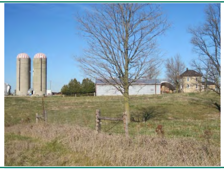
Site # 23 House located at 28140 Seed Road

REPRESENTATIVE CULTURAL STRUCTURES LOCATED WITHIN THE STUDY AREA OR ON OPTIONED PROPERTIES THAT DO NOT HAVE PROPOSED TURBINE RELATED ACTIVITIES